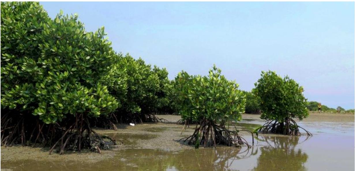
Mangroves with stilt roots in Hainan; © I. Nordhaus

Situated in intertidal areas along the coastlines in the tropics and subtropics, mangroves provide habitats for many organisms and act as a buffer zone against erosion. To cope with the high salt concentrations and wet locations, the trees and shrubs developed a special root and salt filtration system which additionally allows them to maintain water quality. Unfortunately, they are threatened worldwide by pollution, overexploitation, sea level rise and conversion to other uses.