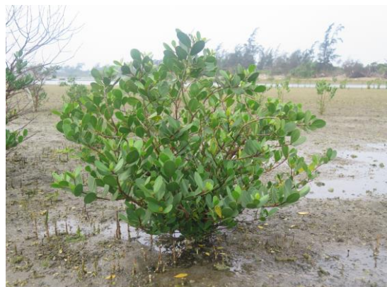
Mangroves in Hainan

Mangroves are trees or shrubs that grow in intertidal areas of coastal and estuarine environments. They are well adapted to daily inundations with seawater, the low oxygen content of waterlogged muddy sediments and the salt concentrations that would harm other plants. Mangrove plants developed a special root and salt filtration system.