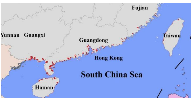
Distribution of China's mangrove forests in 2015 (Chen et al.2017)

In China, the total mangrove area is about 220 km 2 , 92 % of that occur in three southern provinces: Hainan, Guangdong and Guangxi.