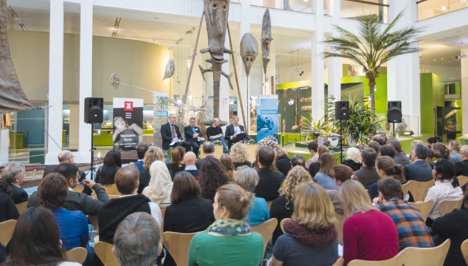
ZMT held a conference on “Ocean Governance” at the Überseemuseum in Bremen.

which aims to strengthen the sustainable use of the coasts, seas and oceans through research, data management and digitalisation, infrastructure and transfer. To this end, the DAM is working together with its member institutions to develop solution-oriented knowledge and to communicate potential courses of action to politics, business and civil society. ZMT is also one of the member of the German Marine Research Consortium (KDM), which brings together the marine science expertise of its member institutions and collectively presents it to policy makers and research funding organisations as well as to the general public.