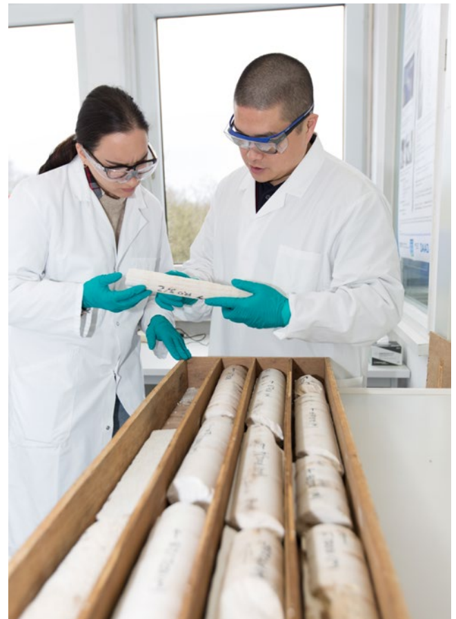
ZMT scientists are using coral cores as archives to document climate change.

ZMT will continue and strengthen its engagement in international CD programs such as those of IOC and IOI.