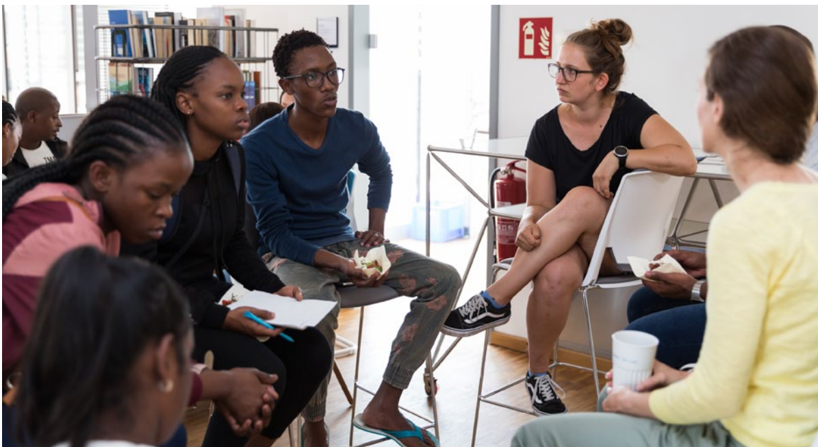
Knowledge exchange is part of ZMT’s strategy on capacity development - as seen here in a meeting with students from Durban, South Africa.

A strong instrument in its function as a hub is the further development of ZMT’s Alumni Network . This currently comprises more than 800 alumni from over 65 countries. This network is strengthened continuously by means of alumni meetings and conferences at ZMT and in the tropics. The events lay their focus on networking between the alumni and ZMT as well as providing information on third party funding opportunities and specific training offers. Alumni Ambassadors represent ZMT in their home countries, offer advice and low-threshold contact of interested students and scientists with ZMT. ZMT is keeping track of its alumni to assess whether the CD