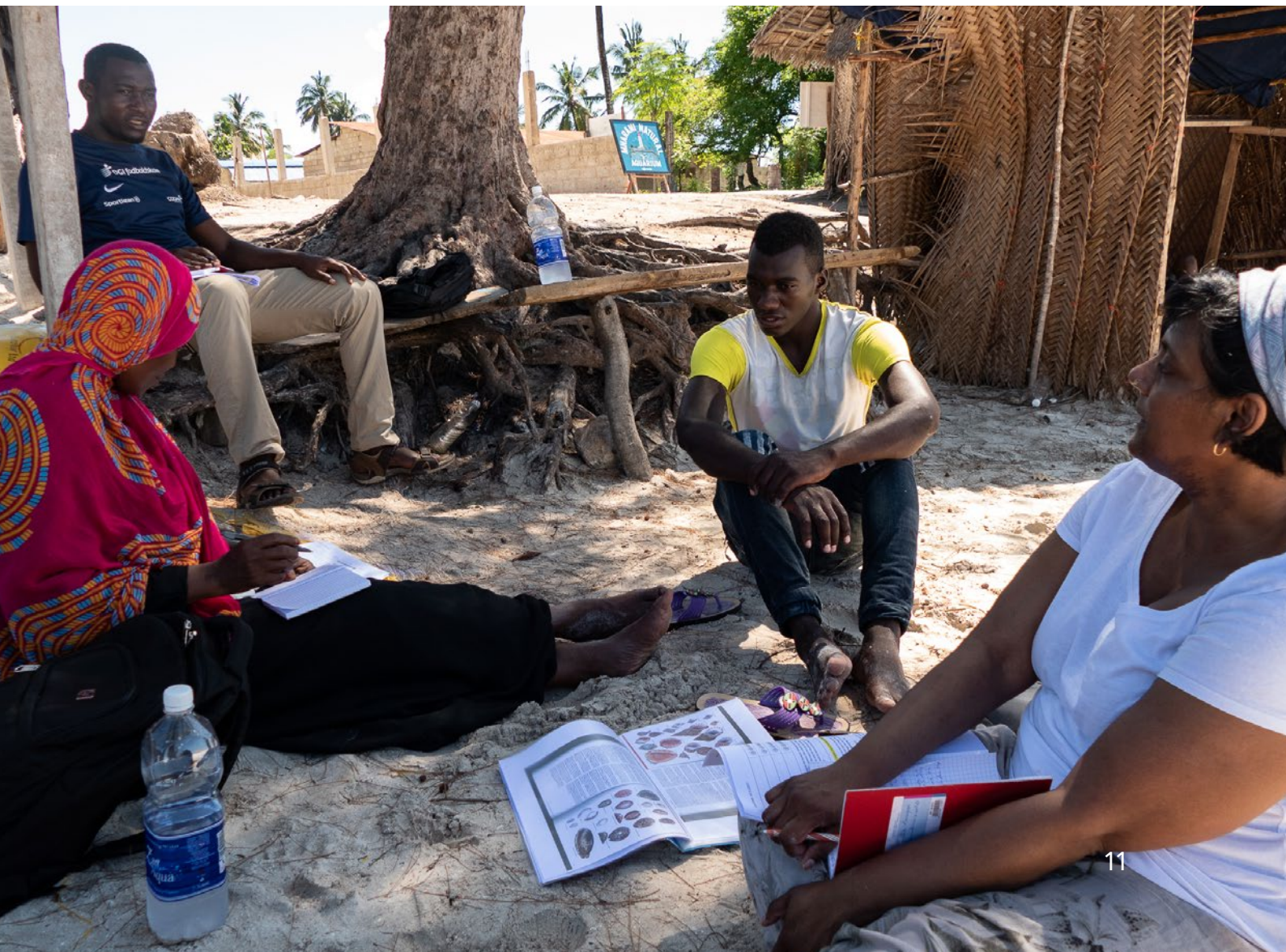
ZMT social scientists interviewing local fishers and shell collectors on Zanzibar.

The “Digital ZMT (DigiZ)” initiative which is an extension of the institute with a new section dedicated to data science and based on the principles of open access, open data, open research design, and citizen science. ZMT links the DigiZ activities as a new thematic focus of our capacity building activities by involving our partners and alumni and developing together training material.